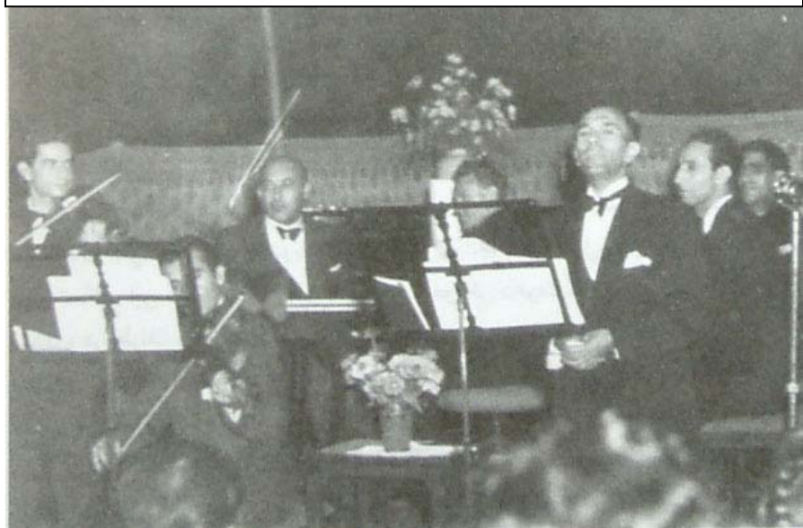
Concert in Iranian Embassy, New Delhi 1946